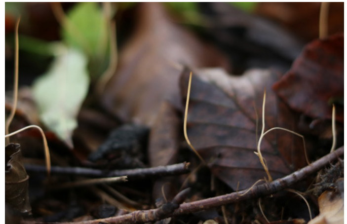
Above left, Macrotyphula fistulosa (PC) and above right, Macrotyphula juncea (JW)

Two species related to conifer and found growing on stumps today were the common Calocera viscosa (Yellow Stagshorn) and the much rarer and intriguing Pseudohydnum gelatinosum (Jelly Tooth). Not related to Hydnum (Hedgehog), the similarity to that species with its spines found underneath is clear. This very unusual jelly fungus never ceases to amaze.