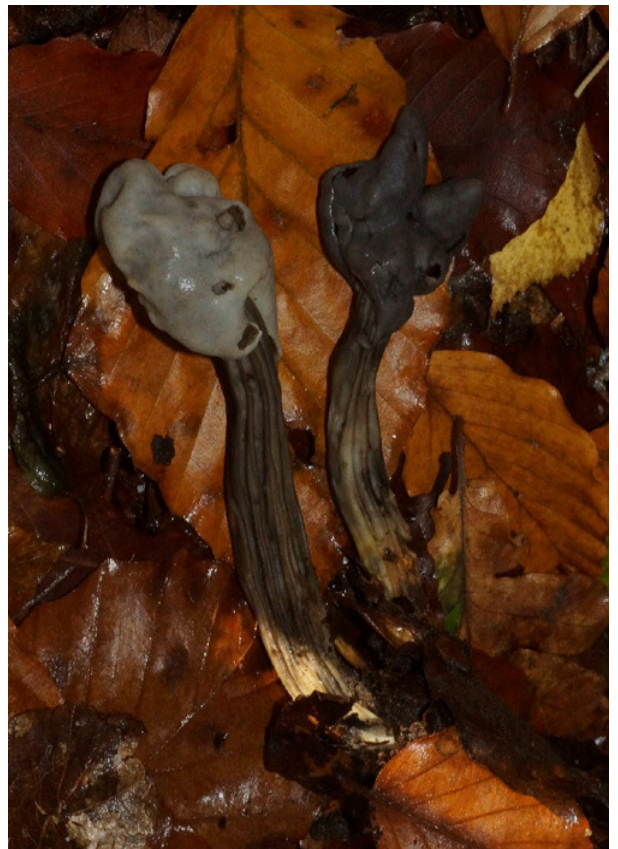
Above left, Helvella crispa near the vicarage lawn, and above right Helvella lacunosa in the woodland area.