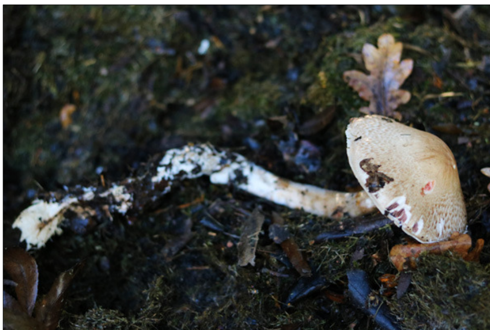
Above, a strangely shaped specimen of Agaricus silvaticus (JW)

At one point Joanna called us over to admire a strange fruitbody which, once extracted from the pile of rotting lawn mowings under the conifer hedge, proved to have an extraordinarily long stem though from its cap it was easily identifiable as a species of Agaricus (the genus of true mushrooms). Its pink gills are not visible in this shot but one can see where I scratched the cap which then quickly started to redden. Colour change in this genus is a useful