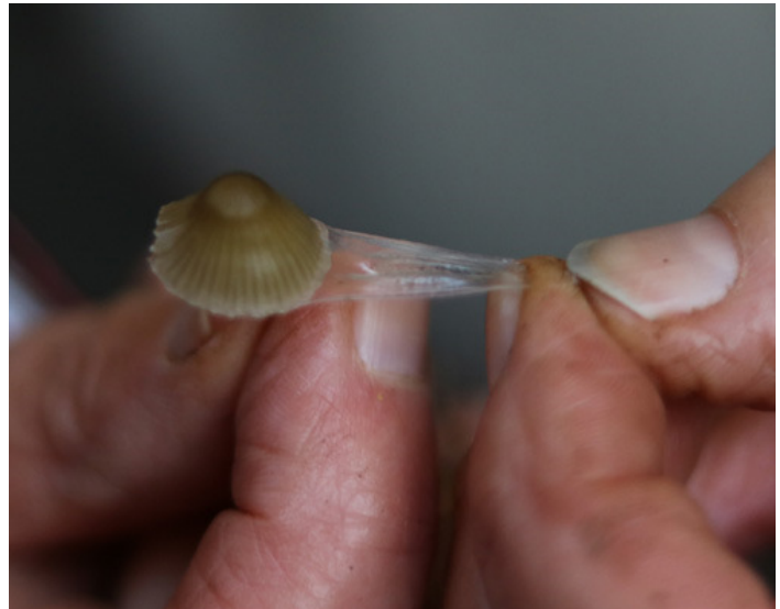
Left and above, Mycena epipterygia showing its sticky cap and stem and the removable gelatinous pellicle. (JW)

It was good to be able to compare two species of the Ascomycete genus Helvella (Saddle) which were found today, one near the vicarage lawn and the other in woodland litter. The darker of the two species, H. lacunosa (Elfin Saddle) can be black or grey, as seen here, where as H. crispa (White Saddle) is always pale and often more 'voluptuous' in shape.