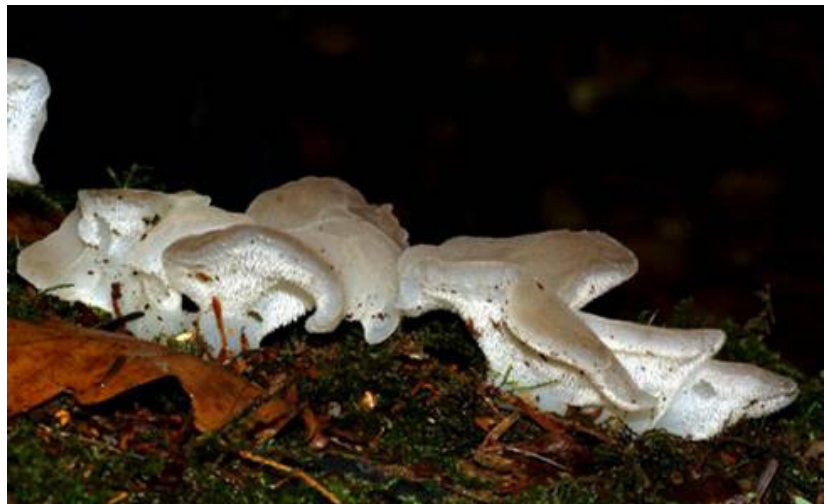
Above, Calocera viscosa, and right Pseudohydnum gelatinosum